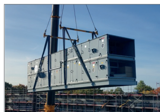
Device base frame