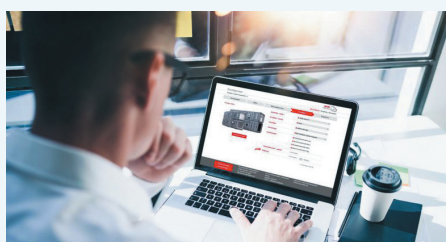
AL-KO AIRCLOUD® for device configuration

in the design of the HVAC system. The BIM CONVERTER offers building planners a practical method for easy and efficient integration of ventilation system data into their Building Information Modeling (BIM).