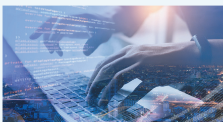
KlimaSoft® certified engineering tool