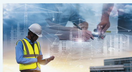
AL-KO BIM CONVERTER for data integration